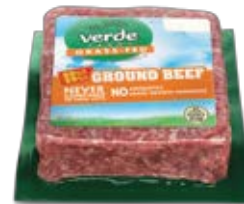
Never Ever Ground Beef 80/20 Item #98307