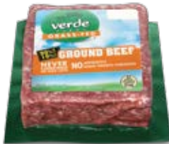
Never Ever Ground Beef 90/10 Item #98305