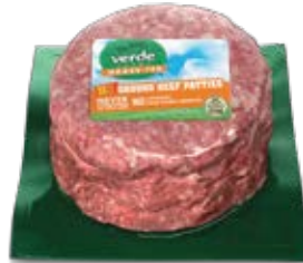
Never Ever 80/20 Patties (4:1) Item #98309