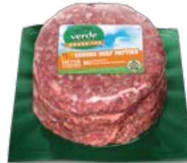
Never Ever 85/15 Patties (4:1) Item #98308