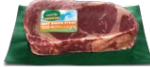
Never Ever Ribeye Steak Item #98304