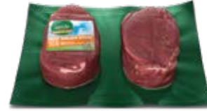
Never Ever Perfect Portion Sirloin Steak Item #98302