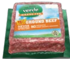
Never Ever Ground Beef 85/15 Item #98306