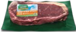
Never Ever Strip Steaks Item #98303