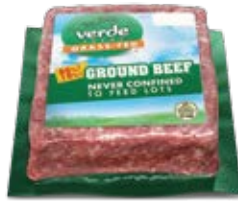
Free Range Ground Beef 85/15 Item #98311