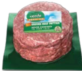
Free Range 80/20 Patties (4:1) Item #98314