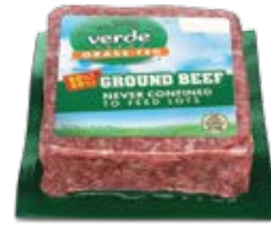
Free Range Ground Beef 80/20 Item #98312