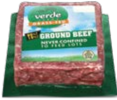
Free Range Ground Beef 90/10 Item #98310