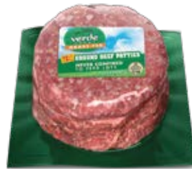
Free Range 85/15 Patties (4:1) Item #98313