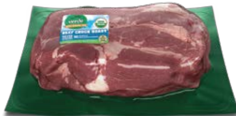
Organic Chuck Roast Item #81037