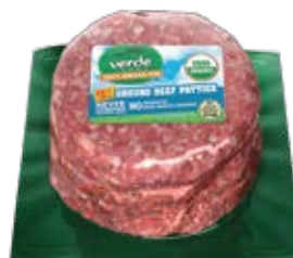
Organic 85/15 Patties (4:1) Item #81035