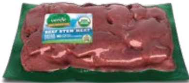
Organic Stew Meat Item #81036