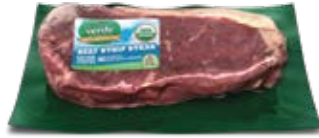
Organic Strip Steaks Item #85627