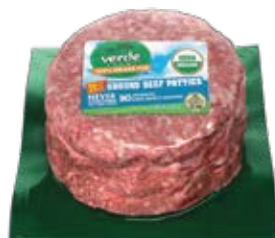
Organic 80/20 Patties (4:1) Item #81034