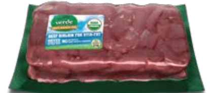
Organic Sirloin Stir Fry Item #92742