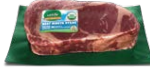
Organic Ribeye Steak Item #85421