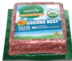
Organic Ground Beef 85/15 Item #81014