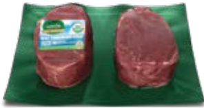
Organic Tenderloin Steaks Item #85429