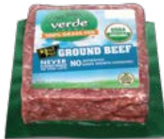
Organic Ground Beef 93/7 Item #85152