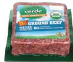
Organic Ground Beef 80/20 Item #99232