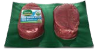
Organic Perfect Portion Sirloin Steak Item #85628